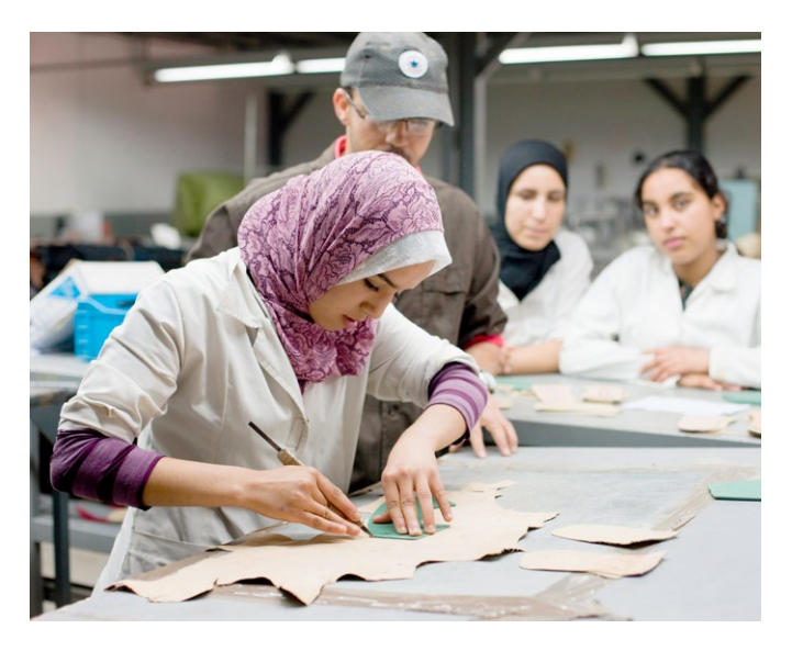
Left: Training is often a part of PI. Right: PI have a direct impact on the local level.