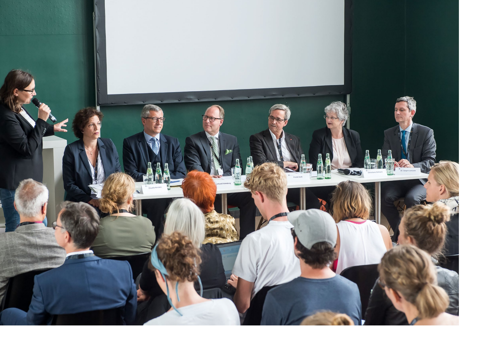
Textiles Partnership members at a panel discussion at the Ethical Fashion Show in 2016 (now Neonyt).