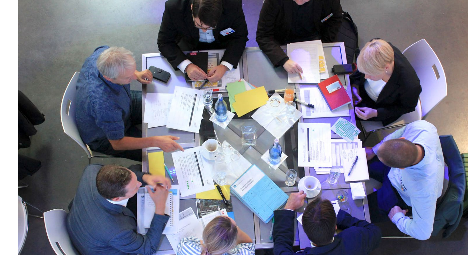
In PI members have the opportunity to share their ideas.